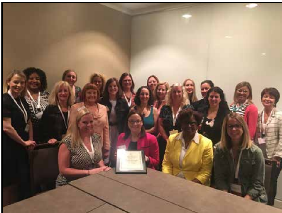
Pictured: The Standing Committee on Women and the Law for the 2016-2017 bar year.